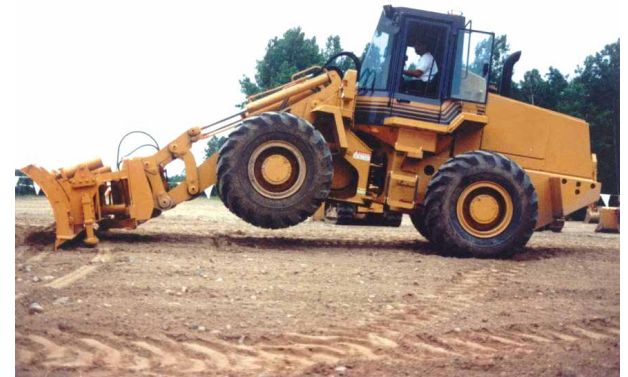
Full Down-pressure Force