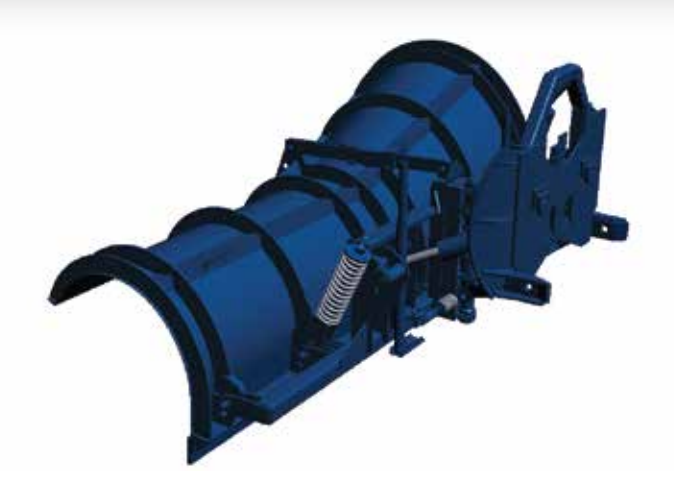
AK-EXP with Parallel Lift Pushframe

While you're out there keeping roads safe, Henke's got your back with knowledgeable support for each of our plows.