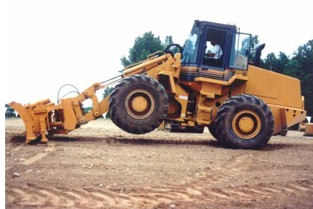
Full Down-pressure Force