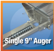
Single 9" Auger