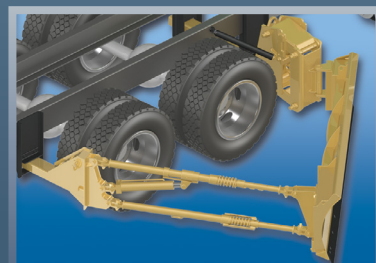
Rear Lift Dual Pushbeam (shown with spring cushioned pushbeam)