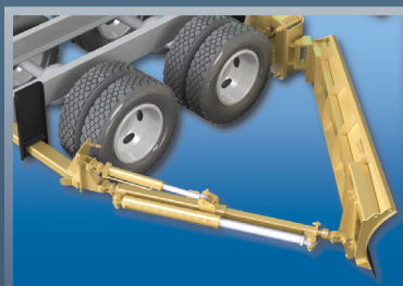
Rear Lift Single Pushbeam (shown with hydraulic adjustable pushbeam)