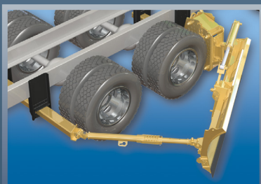
Front Lift Single Pushbeam (shown with spring cushioned pushbeam)